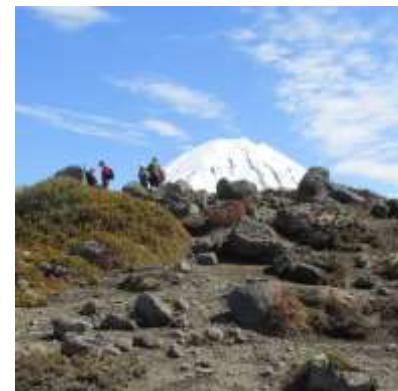
Off track up Tama Ridge

ON the way out slightly more adventure can be had by heading up and over the small hill above the springs to get on to the true left bank of the Waihohonu stream-line and heading downstream to the SE. Most of the walking is easy as it is mainly gravel fan but there is a lot of bog and several stream lines to cross. At some point you must cross to the true right bank and continue - but the going does get a bit rough in places till eventually there is no option but to head, steeply uphill to the right. This is hard work being fairly steep in woodland but quite soon the Oturere track is intercepted – head uphill to the right (W) on this. From here it is about 20 minutes downhill to Waihohonu Hut via the new metal bridge just past the campsite in the valley.