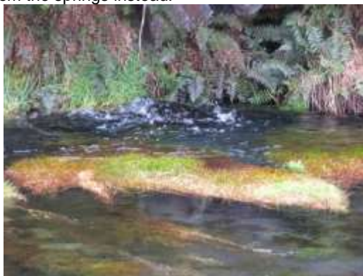
The bubbling spring