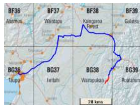
The road from Taupo through BF37 Waitapu map sheet then SW through BF38 Kaingaroa Forest to Murupara and Minginui can be traced above as the BLUE line. The RED line is the Tramp Route