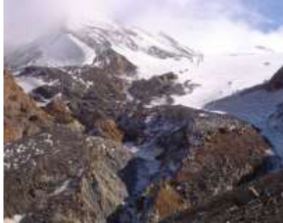
Uphill from the hut towards Ruapehu