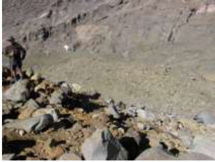
Above the Hut from the ridge