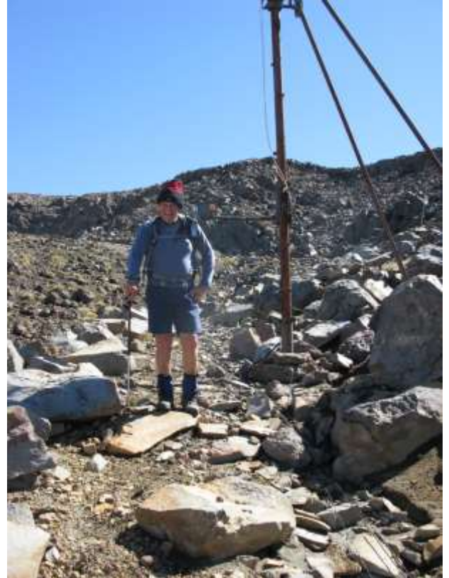
Final few hundred metres to home