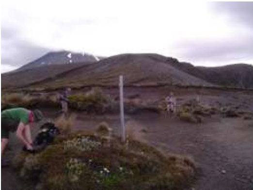
Seat opposite Lower Tama Lake

Once past the obstacle of the large pointed rock work along and round the shoulder of the ridge past the end of the gorge. Now pick a route to descend to and cross the stream flowing N/S below [WP20]. The second gully reached seems to be the best route and it follows a stream-line which has eroded slopes – care is needed as this slope is steep in parts with rather loose material underfoot; there is also thick vegetation near the bottom.